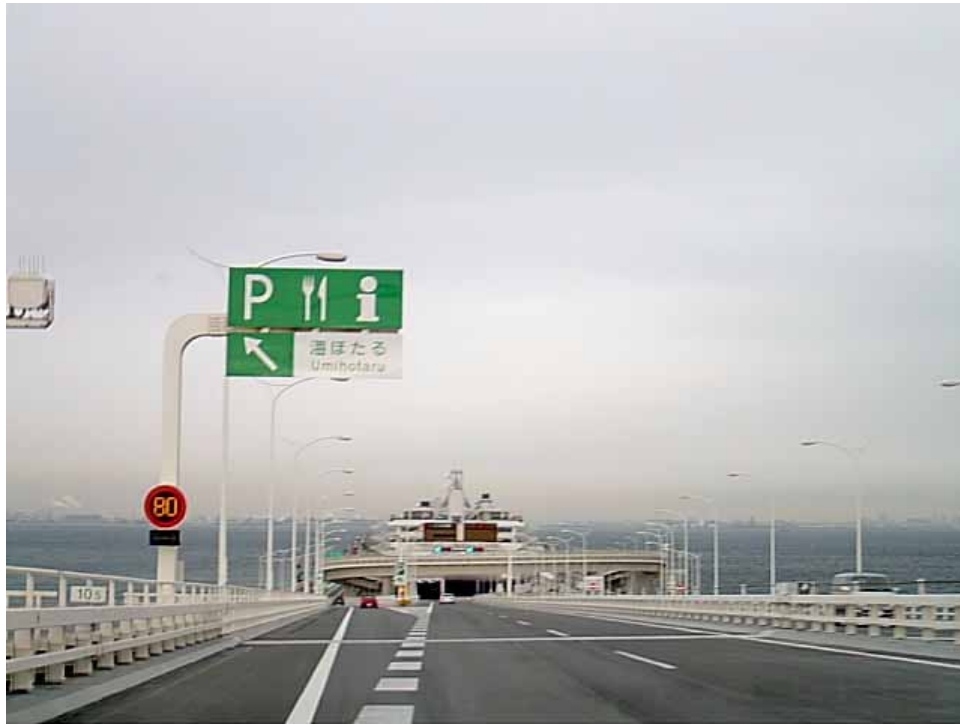
Entrance to Shopping Center Aqua Blue Line (Tokyo Bay Bridge and Tunnel)