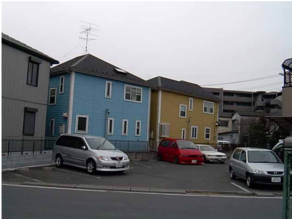
New Infill Single Family Housing, Inner Suburbs of Saitama