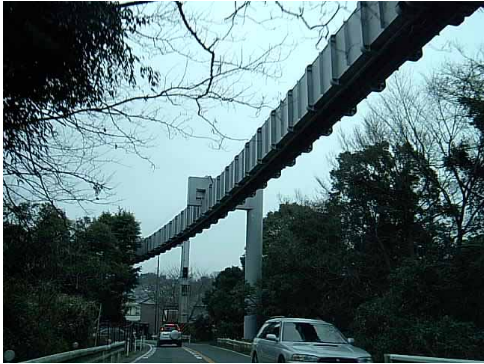
Department Store Sponsored Monorail (Kanagawa)