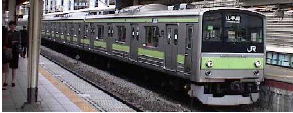
JNR Yamanote Loop Train at Central Station