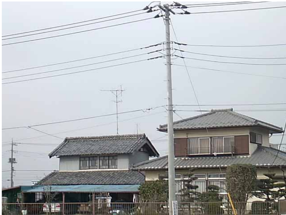
Suburban Single Family Housing