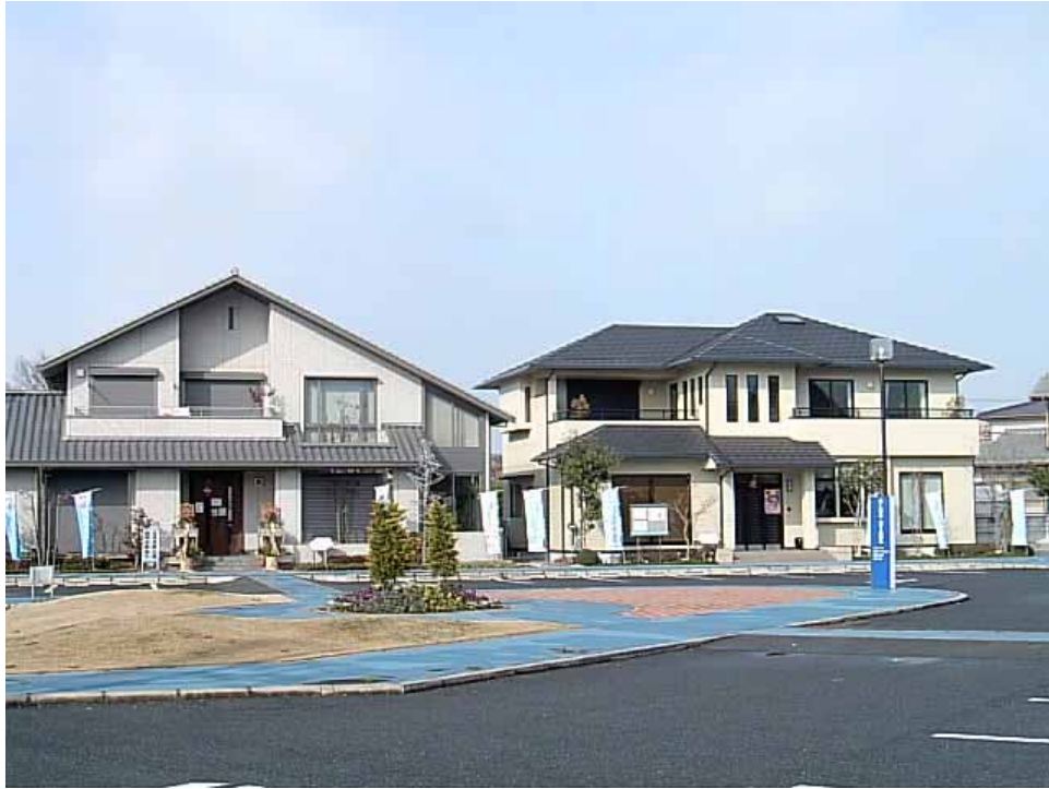
Housing Stage: Honjo