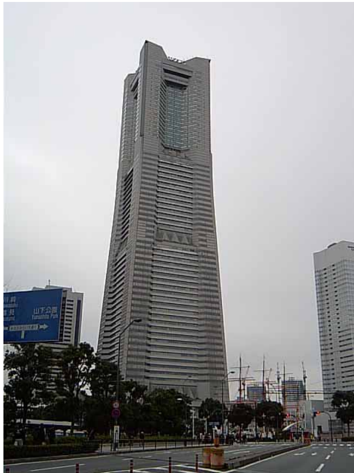
Landmark Tower, Yokohama Tallest Building in Japan (980 Feet)