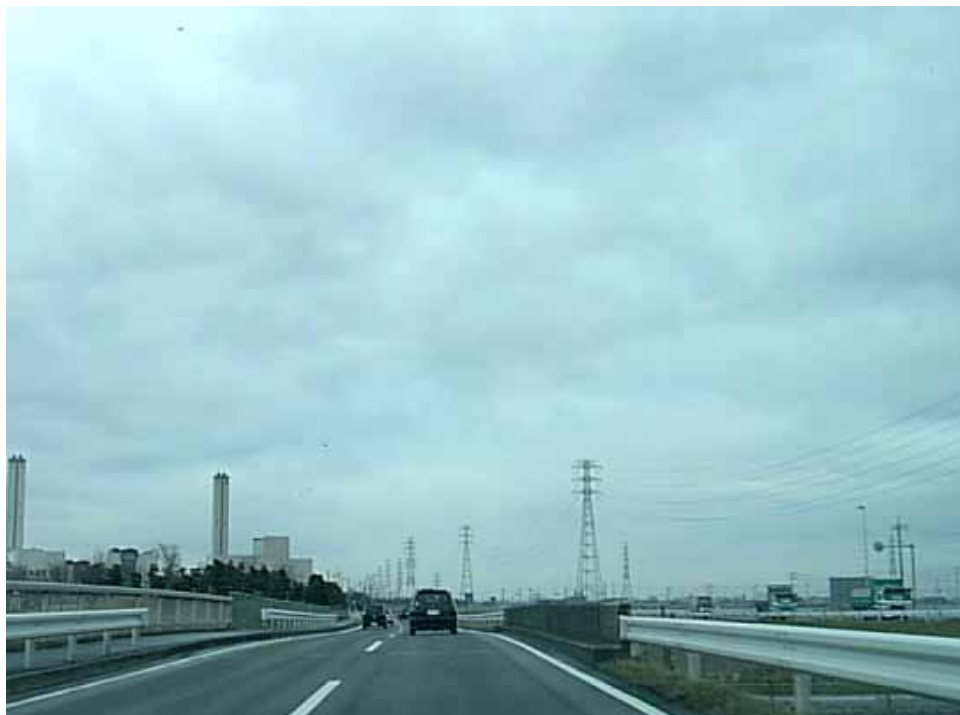
Exurban Expressway: Northern Saitama