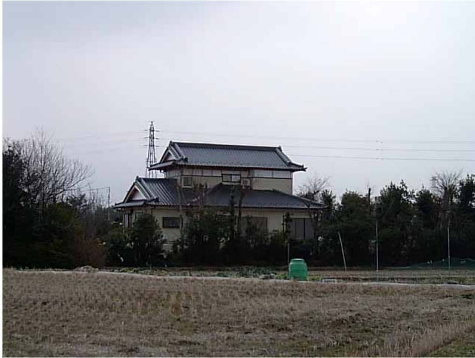
Exurban Residence (Northern Saitama)