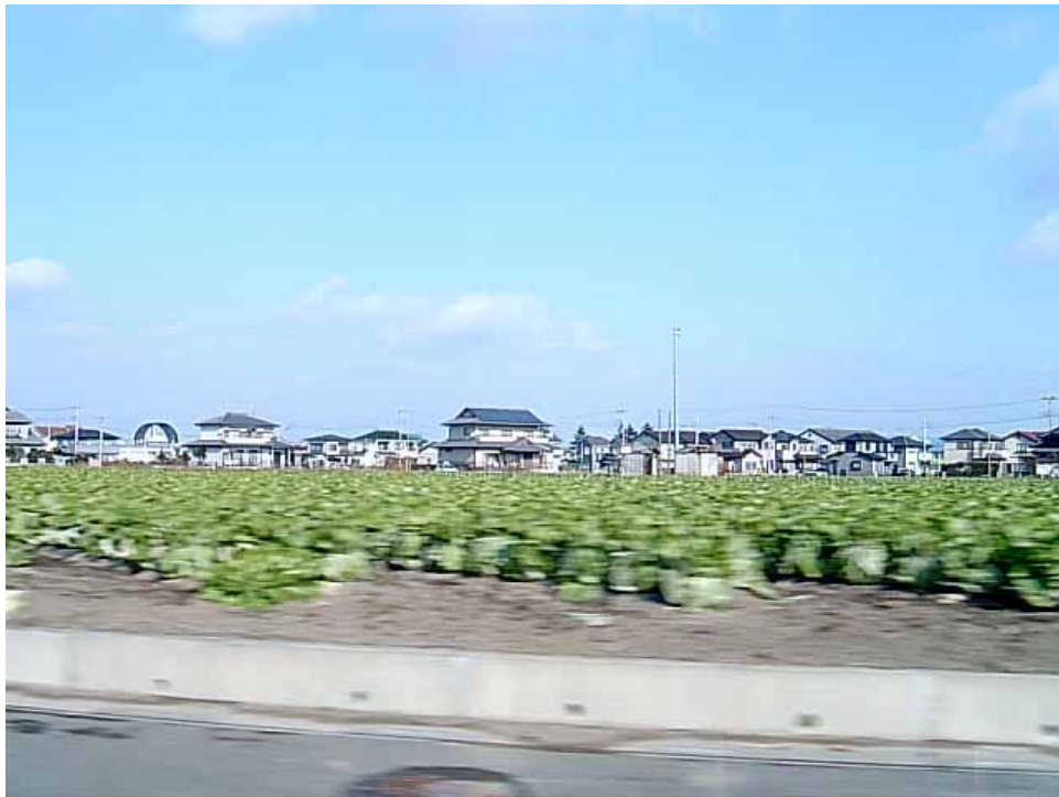
Leap Frog Development: Saitama