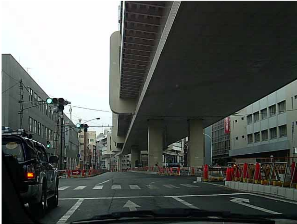
Double Deck Motorway Over City Street