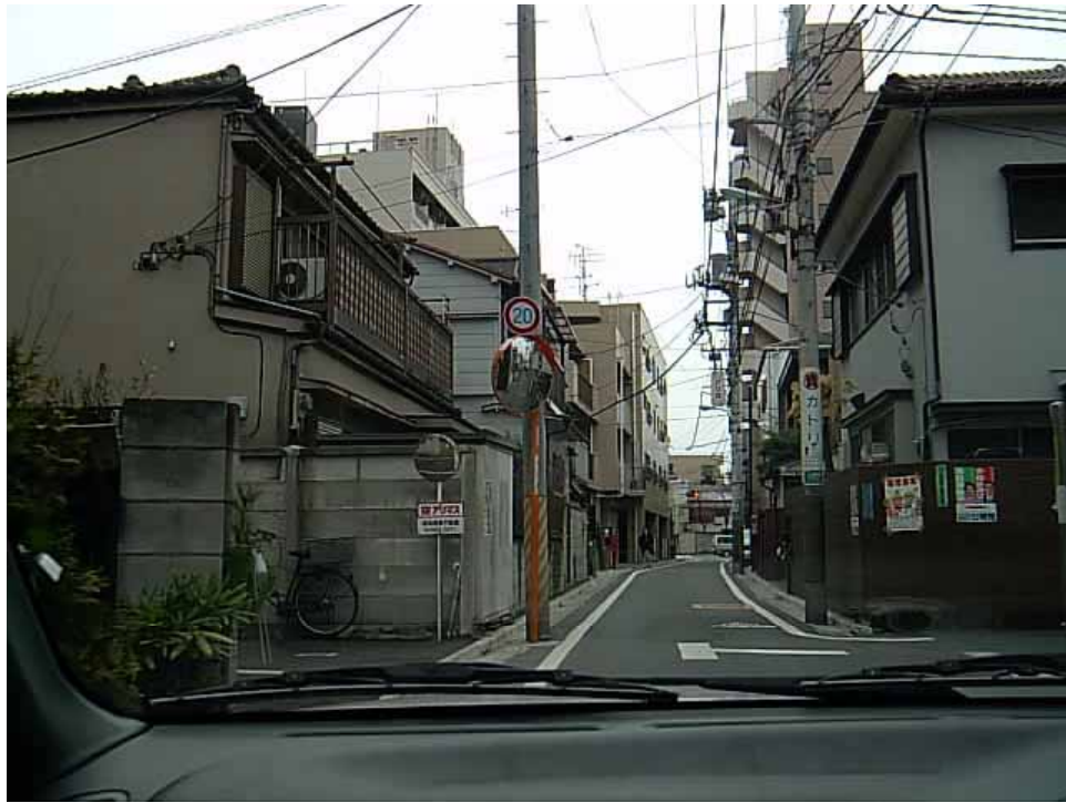
Inner Suburban Multi-Unit Housing